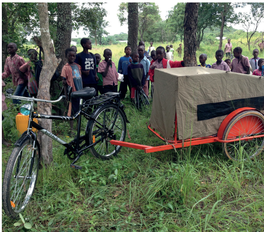
Bicycle ambulance in Mkushi District