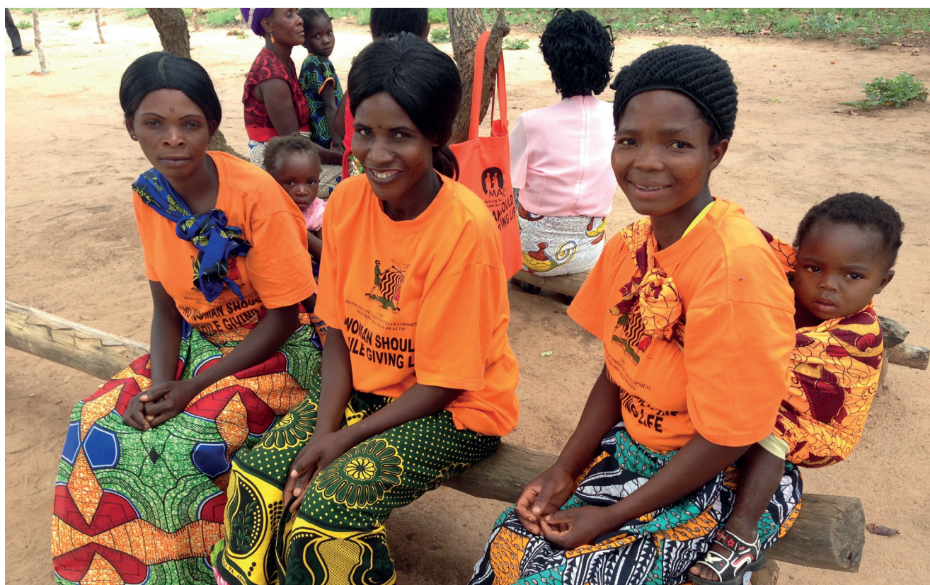
Female SMAGs in Serenje District