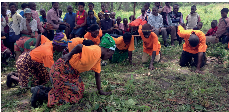
SMAGs demonstrating a maternal danger sign ('long labour')

National scale-up: The programme adopted a flexible, responsive approach to national scale-up, stepping in to support MCDMCH's scale up plans on request. Support was provided for provincial level training of trainers activities, and in one province, MORE MAMaZ supported geographical scale-up using a 'demonstration district' approach.