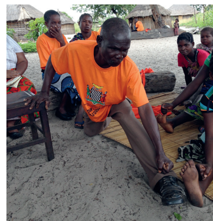
Male SMAG in Mongu demonstrating maternal danger sign ('hand and foot come first')