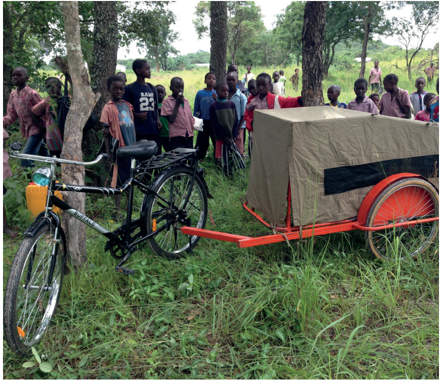
Bicycle ambulance in Mkushi District