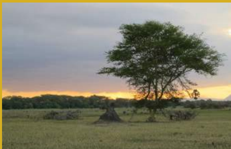
Liwonde National Park