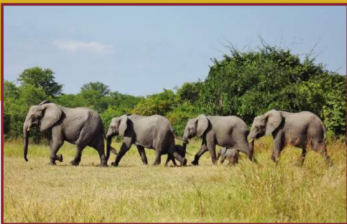
Elephants in the Liwonde National Park

En route today, we'll also get to pass through the town of Mangochi (formerly known as Fort Johnston). This old colonial town is situated on the Shire River, at the southern tip of Lake Malawi.