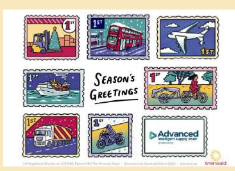
Personalised Christmas e-Card