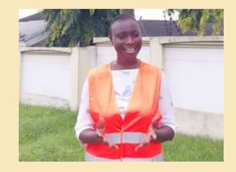
Personalised Thank-you Video