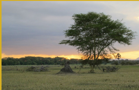
Liwonde National Park