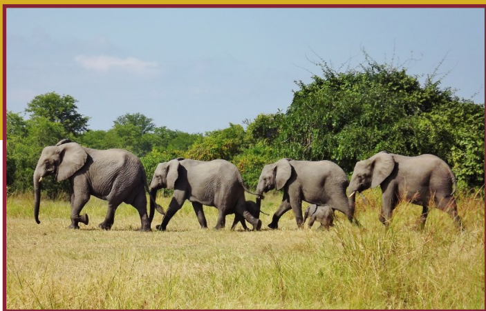
Elephants in the Liwonde National Park

En route today, we'll also get to pass through the town of Mangochi (formerly known as Fort Johnston). This old colonial town is situated on the Shire River, at the southern tip of Lake Malawi.